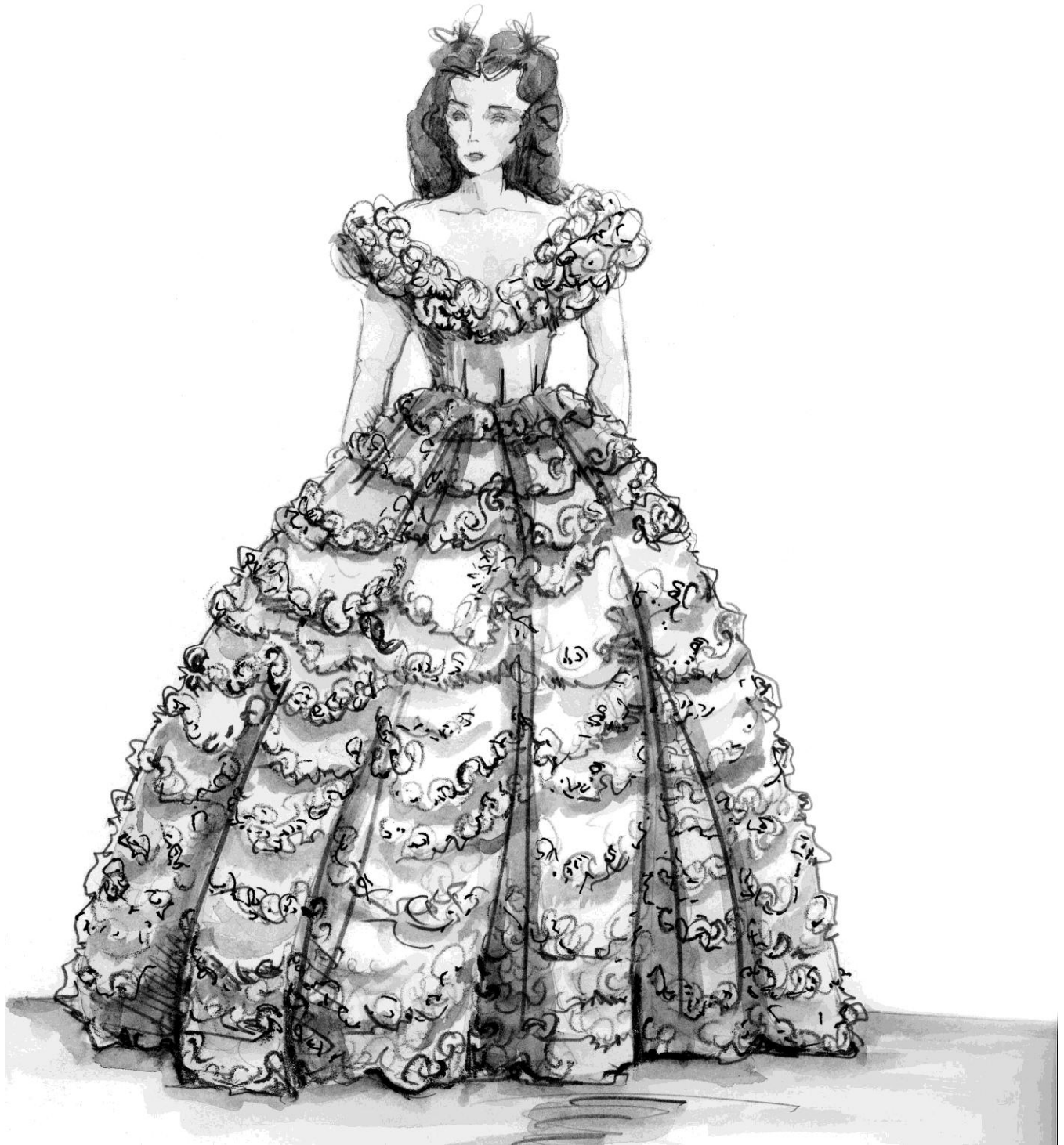
Sketch of the Youth Eco-Dress