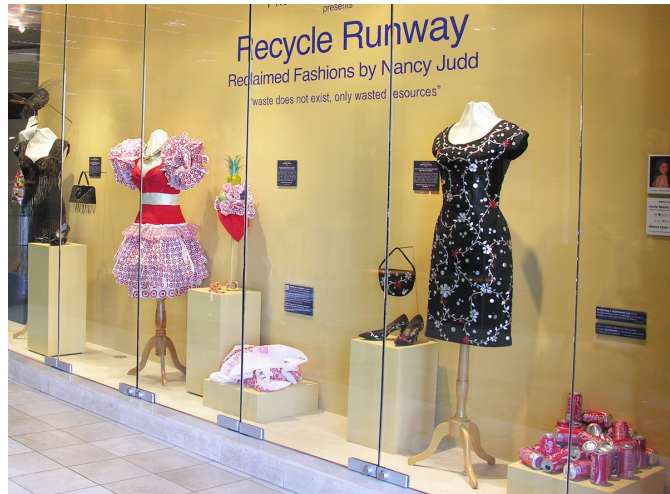
Recycle Runway at the Phoenix International Airport, March - September 2010

The Recycle Runway Collection of glamorous recycled fashions will be installed throughout International Concourse E in the Atlanta Airport in January 2011. The exhibition will be on display for one year. It will be seen by over 13.5 million people .