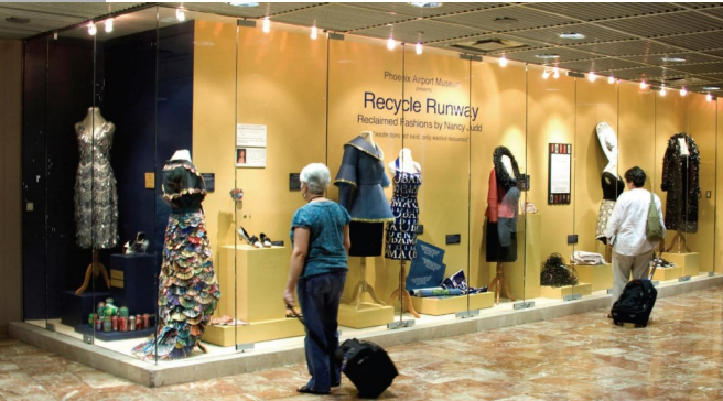
Phoenix International Airport

The Recycle Runway Exhibition will be installed in nine cases located throughout International Concourse E on either side of the restrooms down the length of the Concourse (see terminal map). Each case will feature Recycle Runway garments and will have a specific environmental message. Eight cases will be available for exclusive sponsorship. The first organizations to commit will get to choose the location of the case(s) that they want to sponsor, December 17, 2010 is the deadline to sign-up.